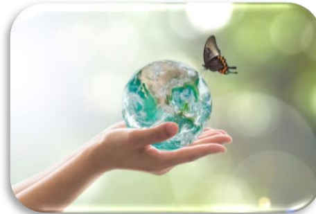
Environmental and Social Health Determinants