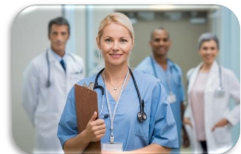
Health Care Systems