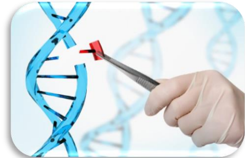
Non-communicable and Rare Diseases