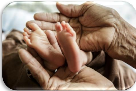
Health throughout the Life Course