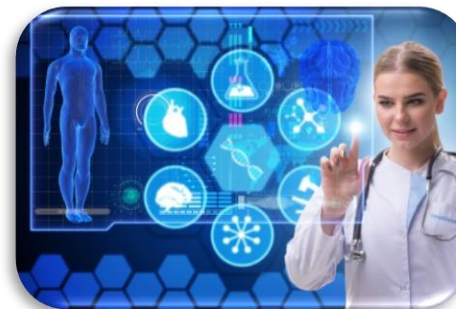
Tools, Technologies and Digital Solutions for Health and Care